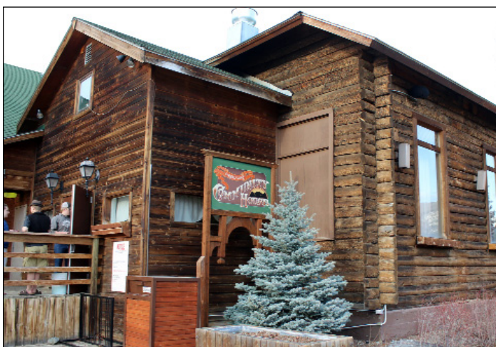
The event was held in the historic "Grand Lake Community House" in Grand Lake, CO.