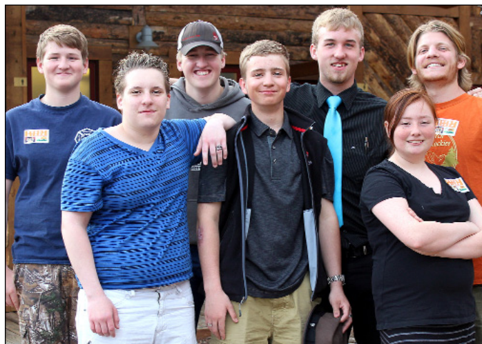
Members of "The Catch" Christian Youth Group of Grand County volunteered their time at the event.